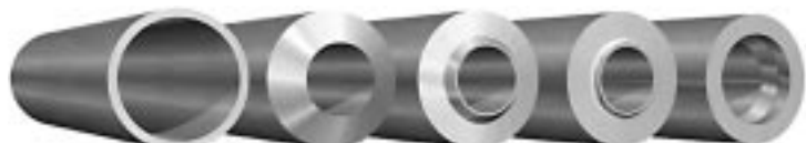
Square Bevel Compound "J" Prep Counterbore

DURABIT™ tool bits are available for all weld preps.